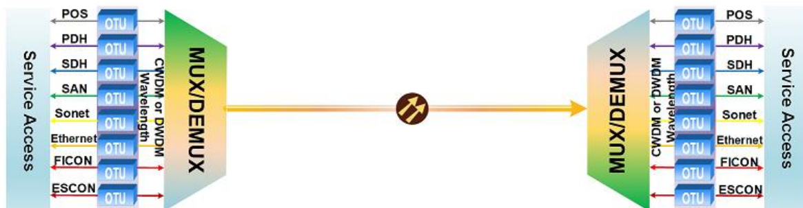
Figure: OTU Application

The product wavelength conversion (OTU) card is widely used to perform 3R amplification (reamplification, retiming, reshaping) on various types of access service signals through a wavelength conversion board. Then the converted wavelength needed to transmit the wave system is coordinated with the multiplexer and splitter for transmit.